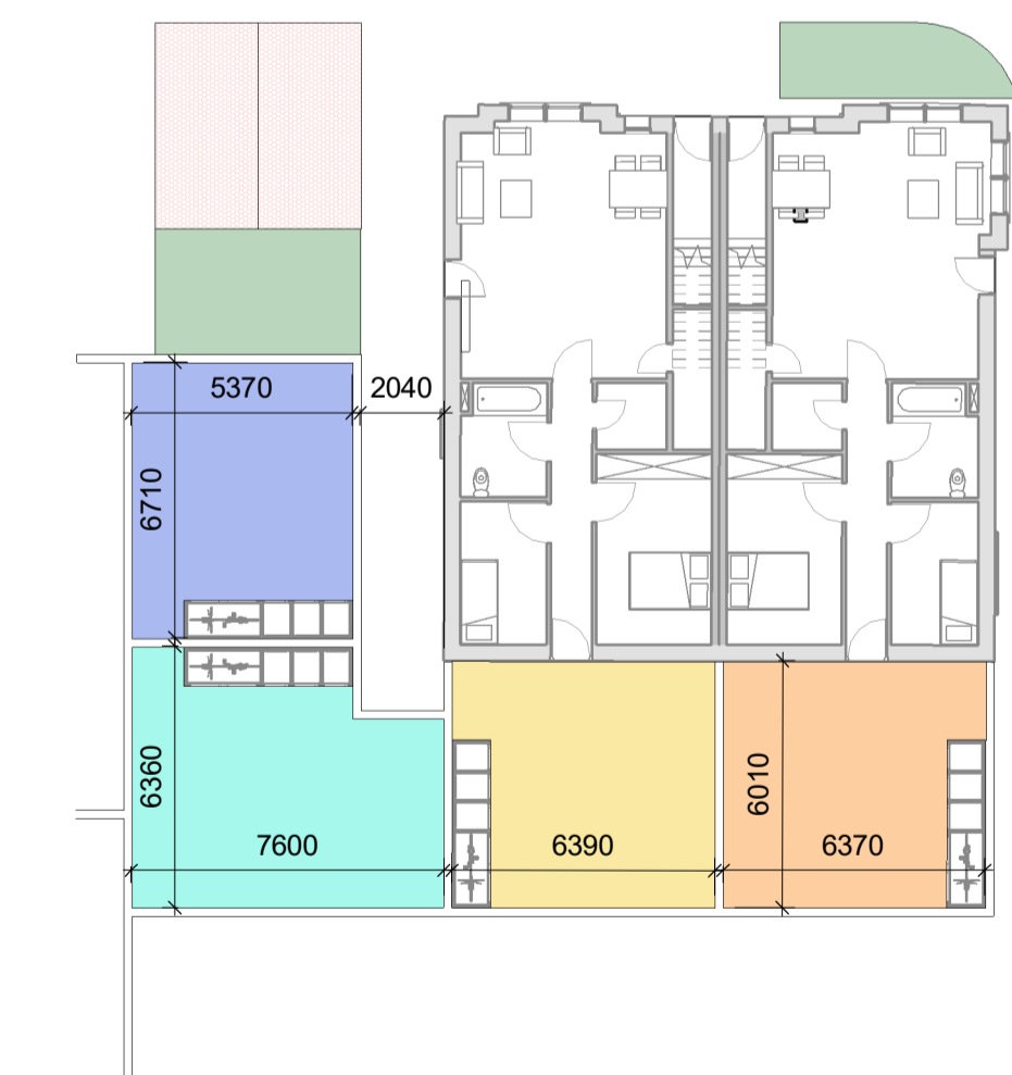
6 Maisonette D - 2 Beds 1: 200