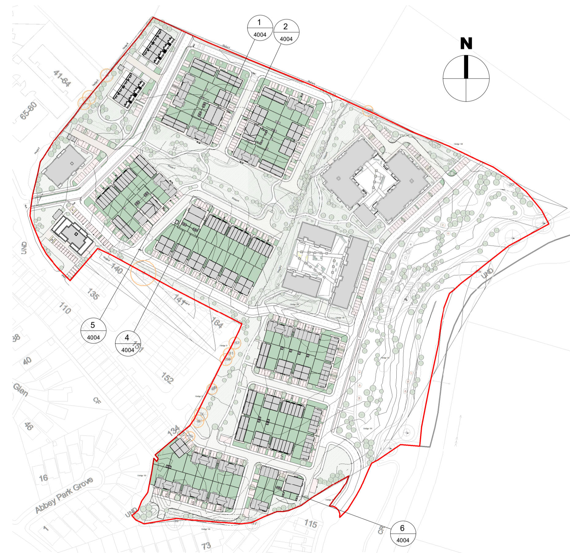
7 Proposed Site Plan_Maisonettes Detail - Key 1: 2000