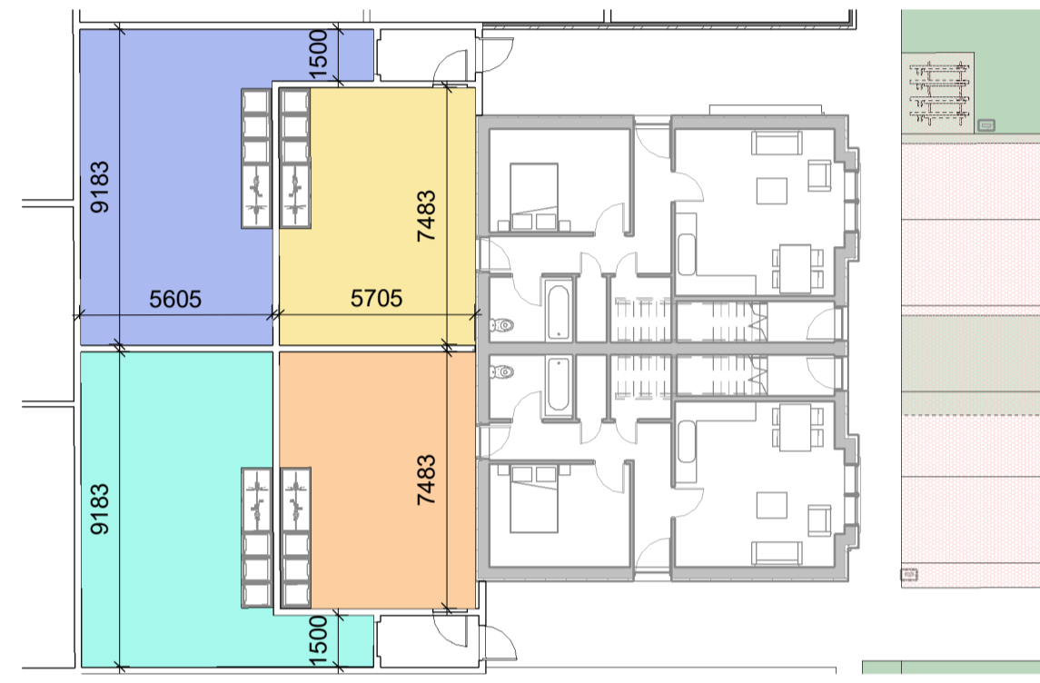
5 Maisonette F - 1 Bed 1: 200